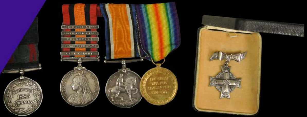
The Dunne family medals

This collection is also interesting because it belongs to one family. It is a story that we will be able to tell across many generations and four different conflicts."